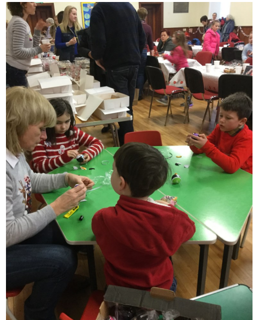
Breakfast with Santa & Snow Fun